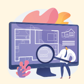
ESTATE MANAGEMENT POLICY