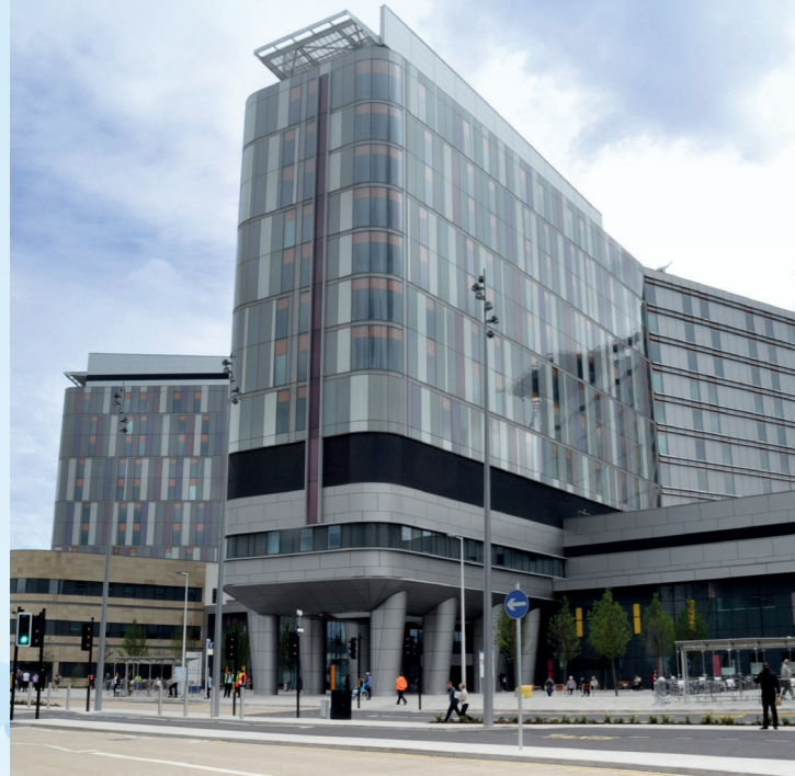
Accurate as at September 2016